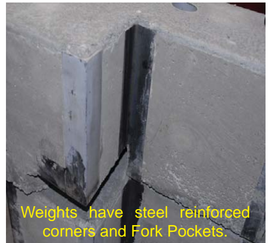
Weights have steel reinforced corners and Fork Pockets.

Large Weight per half, is 764 lb. 12" H x 46.5 SQ. Small Weight per half, is 567 lb. 12"H x 36" SQ.